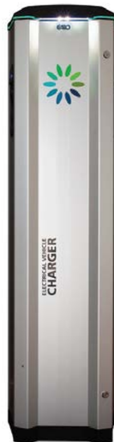
STANDARD / TALL